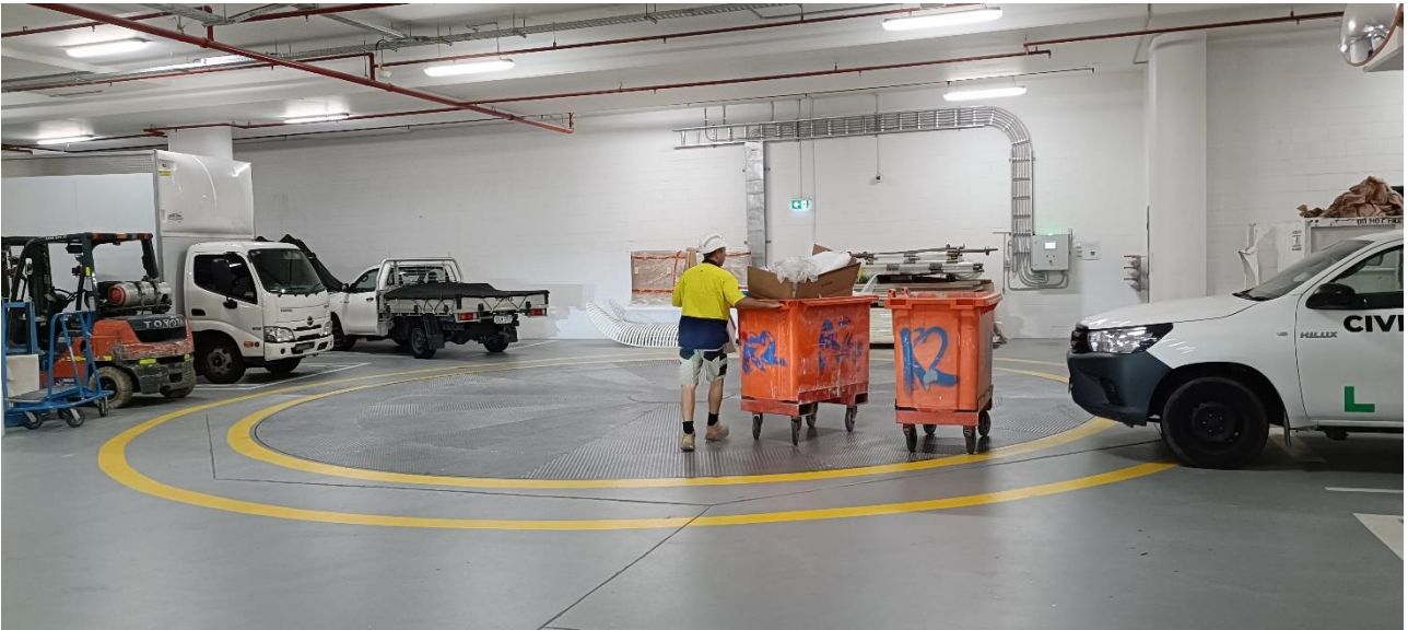
Photograph C.10 Loading Dock and waste management, note turntable to allow trucks to exist in a forward direction.