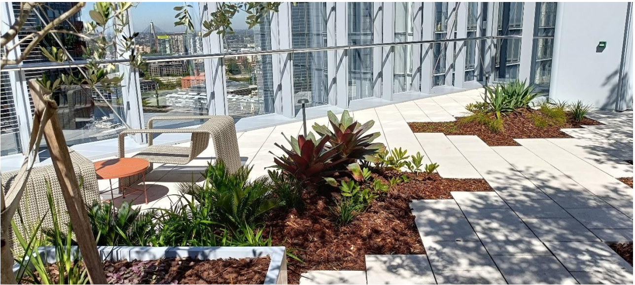
Photograph C.7 Landscaped area on Level 31