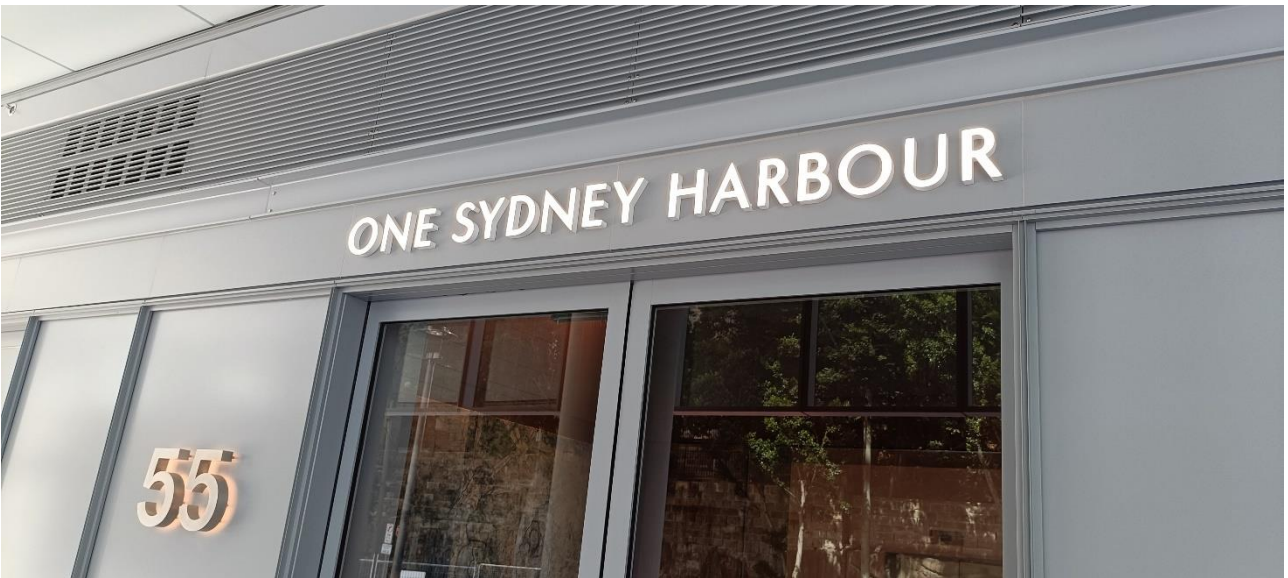
Photograph C.6 Building signage and number East Elevation Hickson Road