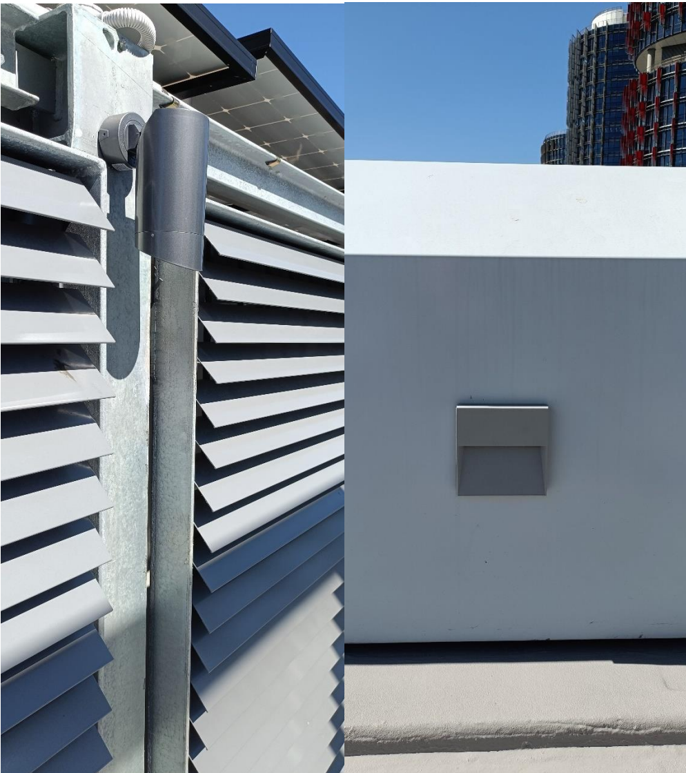
Photograph C.8 Roof lighting examples, note downward focus