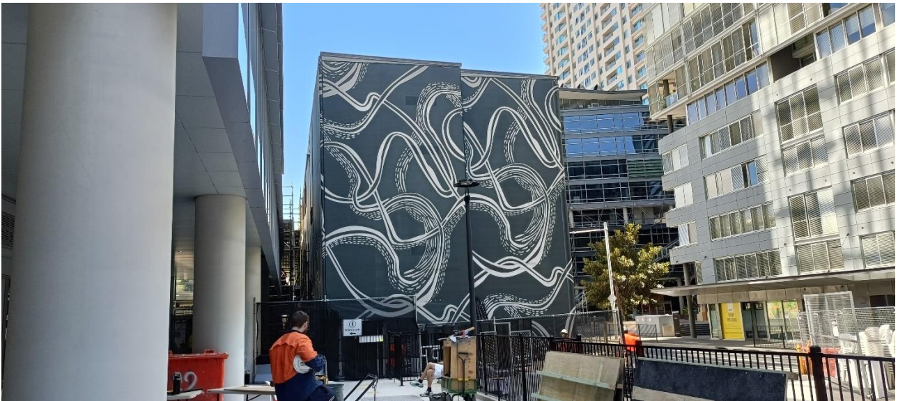
Photograph C.3 Temporary offices on Hickson Road