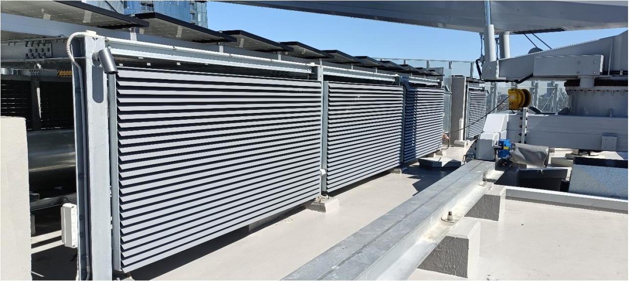
Photograph C.9 Louvre panels around rooftop AC units, note solar panels on roof.