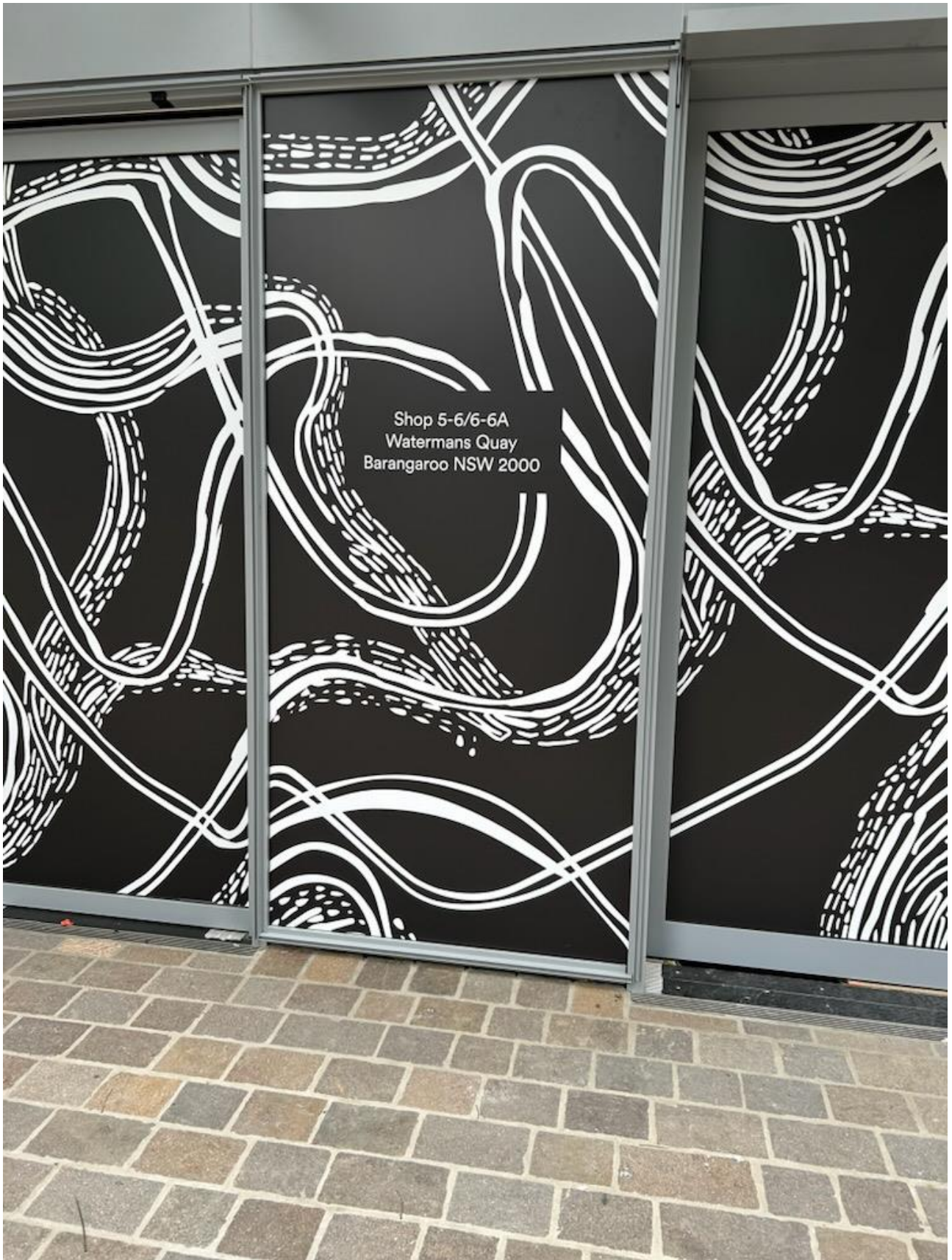
Photograph C.13 Example of shop front numbering (E25)