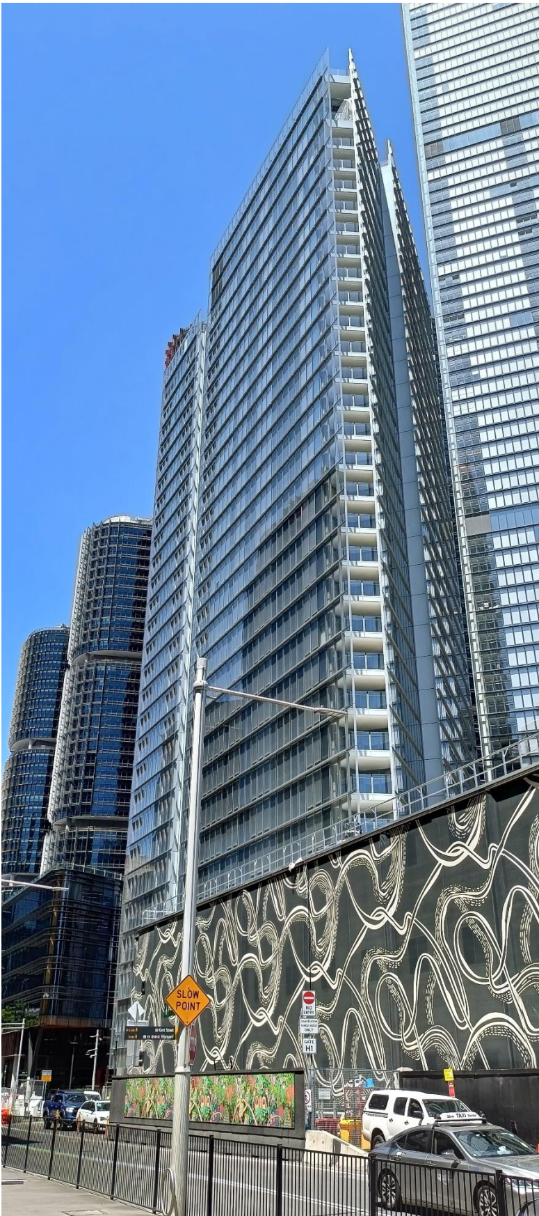
Photograph C.1 External building and Gate H1 from Hickson Road