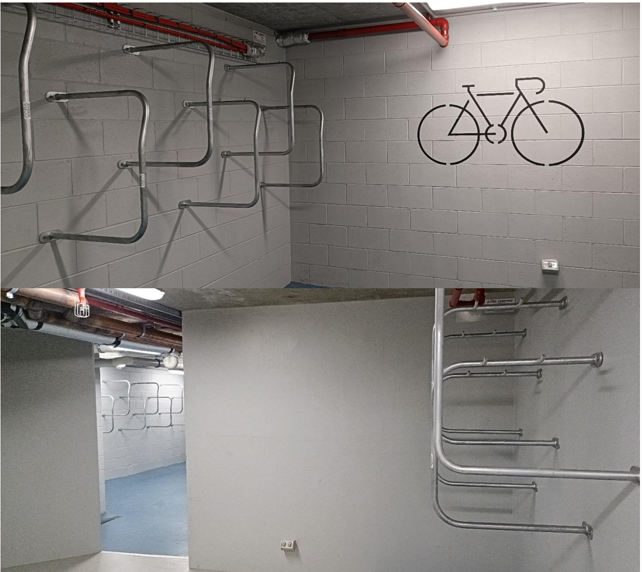
Photograph C.12 Bicycle storage areas