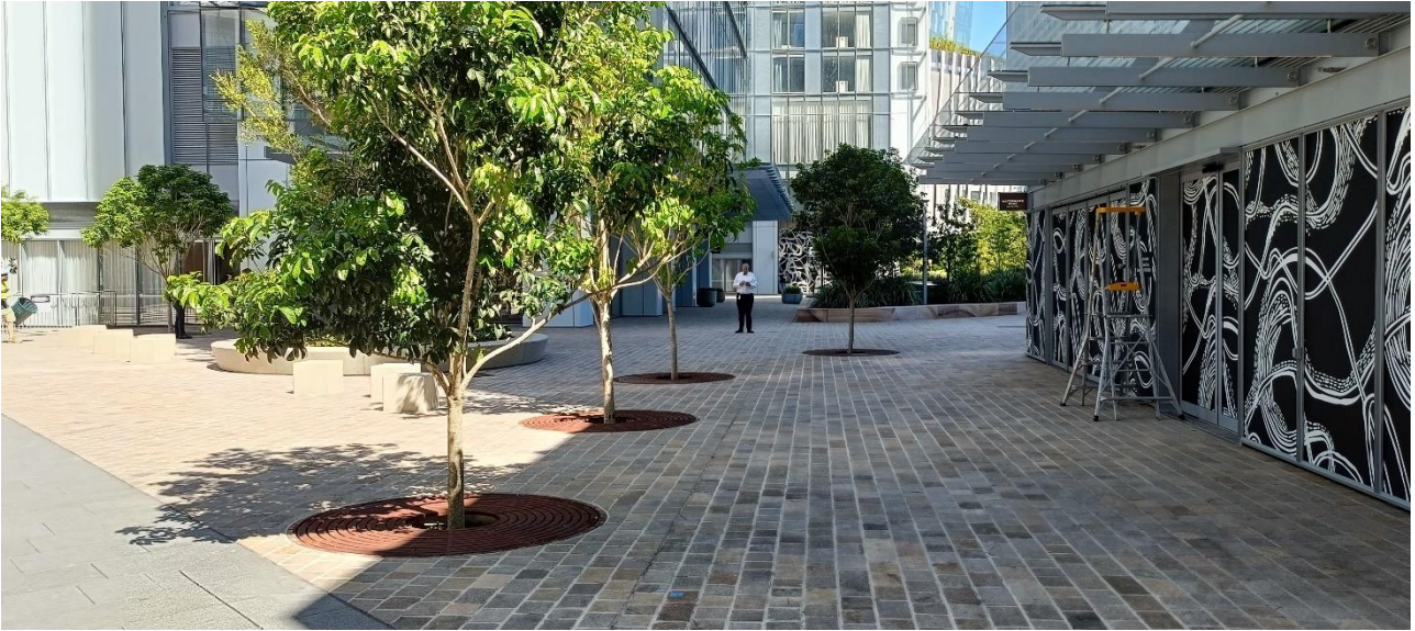
Photograph C.5 Landscaping in public domain outside of retail spaces