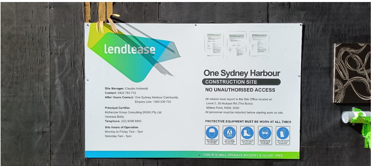
Photograph C.4 Project signage