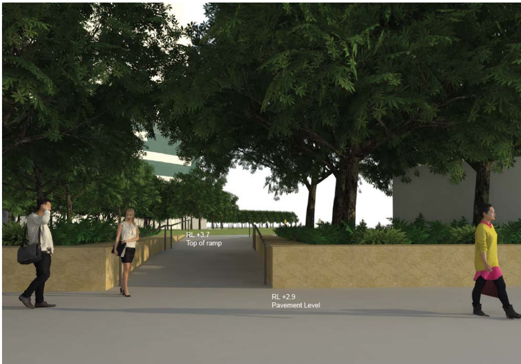
Figure 6 – View 3, looking north-west across Hickson Park