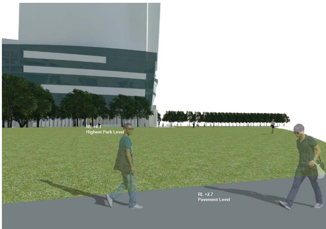
Figure 4 – View 1, looking north-west across Hickson Park