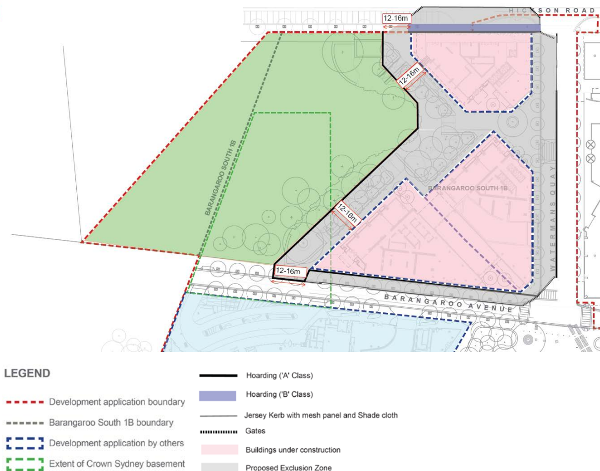
Figure 1 – Proposed exclusion zones (not to scale)

In light of the majority of the public domain being provided consistent with the intent of condition B12 of the Concept Plan, and that it specifically contemplates that not all of the public domain may be available at the time of the first OC (in respect of Barton Street), it is our view that the consent authority can be satisfied that the proposed request for an exclusion zone to protect public safety is generally consistent with Condition B12. Figure 1 below demonstrates the extent of the proposed exclusion zones, as currently contemplated.