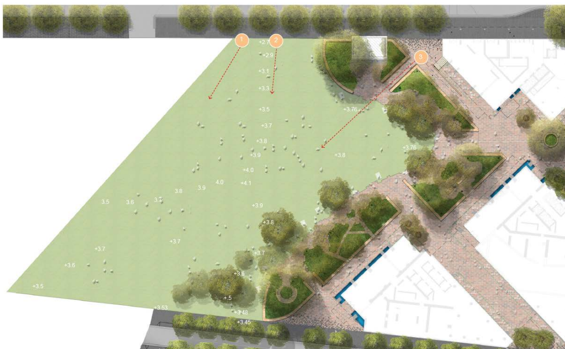
Figure 3 – Location of tested view corridors across Hickson Park

In addition, the proposed levels allow for suitable drainage and cross falls throughout the park. It is noted that the lowering of proposed levels would result in numerous drainage pits through the central area of Hickson Park, which would reduce amenity for future users and result in an overall reduction in the amount of lawn area available.